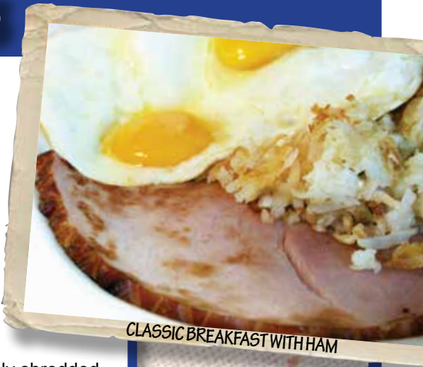
CLASSIC BREAKFAST WITH HAM

Two farm fresh eggs cooked to order. Served with your choice of savory sausage links, sausage patty veggy patty or ham 8.29