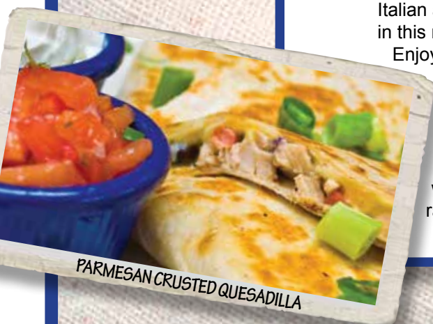
PARMESAN CRUSTED QUESADILLA

Italian and Mexican collide in this multi-cultural mash-up. Enjoy gooey melted Monterey Jack cheese, tomatoes, green peppers, chicken breast and red onions enveloped in a Parmesan crusted tortilla. Served with a side of our Jalapeno ranch dressing 8.99