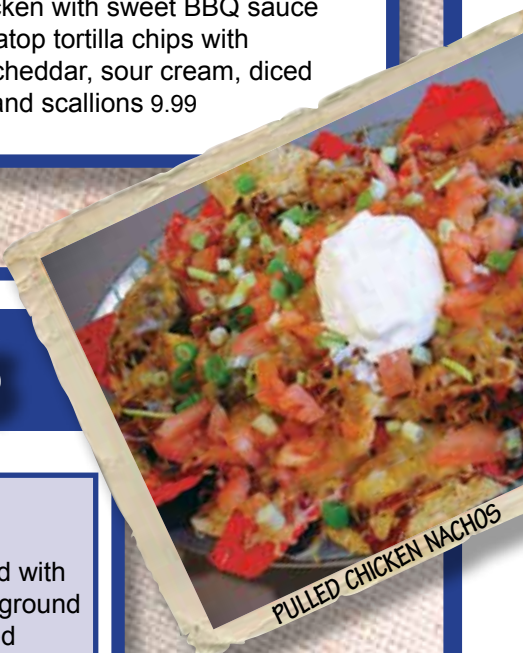
PULLED CHICKEN NACHOS

Pulled chicken with sweet BBQ sauce piled high atop tortilla chips with shredded cheddar, sour cream, diced tomatoes and scallions 9.99