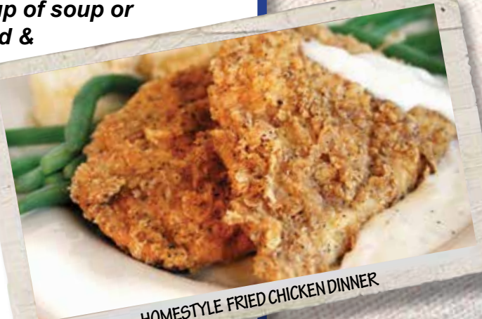
HOMESTYLE FRIED CHICKEN DINNER

We start with fresh boneless chicken breasts, breaded in our special seasoned breading and then cook them to a golden brown. Served with honey mustard dipping sauce 9.79